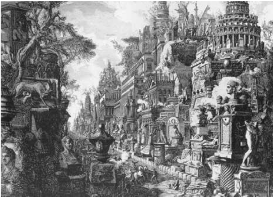
Giovanni Battista Piranesi, Le antichità romane , 1756

La Société Italienne d'études du XVIII e siècle a le plaisir de présenter la candidature de Rome comme siège du Congrès International de la SIEDS/ISECS dans les Universités La Sapienza et “Tor Vergata” de Rome, du 3 au 7 juillet 2023. Le sujet proposé est L'Antiquité et la construction du futur à l'âge des Lumières , un thème qui s'adapte particulièrement à la ville de Rome, exemple unique de dialogue entre l'Antiquité et la modernité au XVIII e siècle.