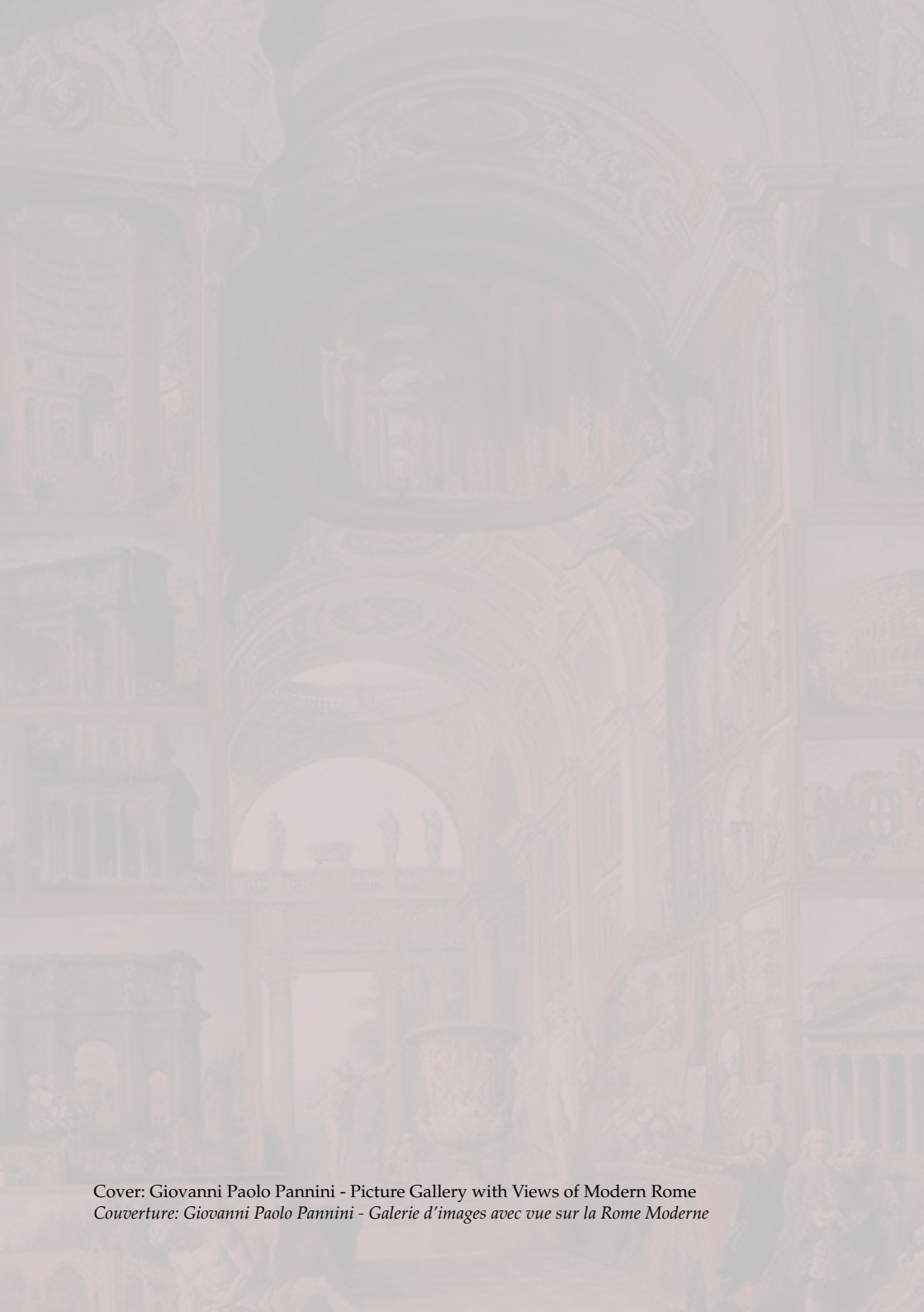
Cover: Giovanni Paolo Pannini - Picture Gallery with Views of Modern Rome Couverture: Giovanni Paolo Pannini - Galerie d'images avec vue sur la Rome Moderne